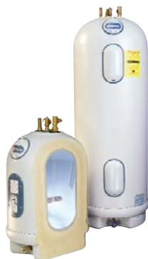
Rebates are available on energy efficient water heaters (at left) and heat pumps (below).