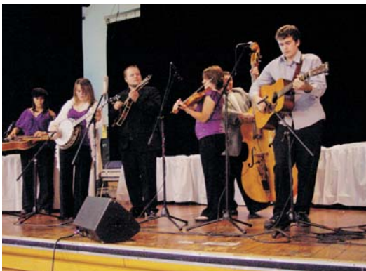
Above, the award-winning bluegrass group, the Martins, provided entertainment, and below, hundreds of New-Mac customers signed postcards expressing their concerns about energy legislation to their Senators.