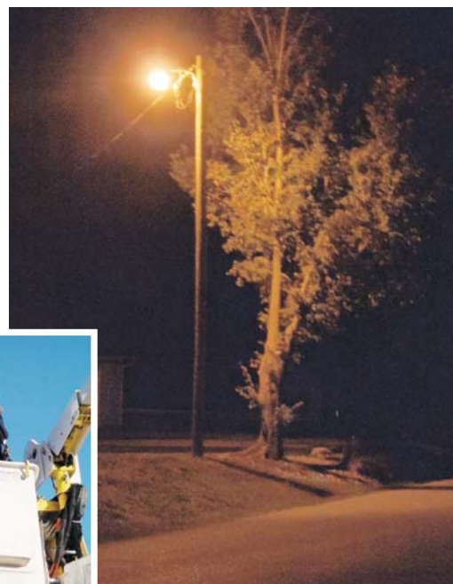
New-Mac will install and maintain a security light on an existing meter or transformer pole at your location for $10 a month.