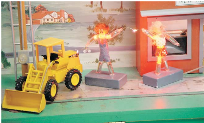
Neon Leon and Lightning Liz always manage to grab the attention of the usually third- and fourth-grade audiences at area schools. Kids learn lessons through the misadventures of the two neon characters.

Each year, we teach hundreds of kids, but it's not just in the classroom. From 4-H clubs to scout troops, New-Mac