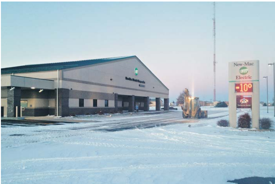
One might argue that it was too cold for anyone to be out the morning of Jan. 6, but the New-Mac Electric parking lot was being scraped during the minus-10 degree weather.