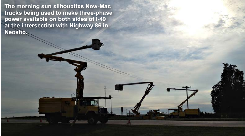
The morning sun silhouettes New-Mac trucks being used to make three-phase power available on both sides of I-49 at the intersection with Highway 86 in Neosho.