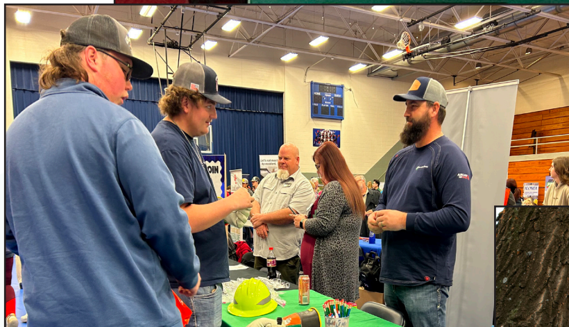
New-Mac uses power town to demonstrate the dangers of electricity (above). Below, we encourage kids to get out and play but always look up before climbing. (At left) Your co-op attends many school functions to teach safety.