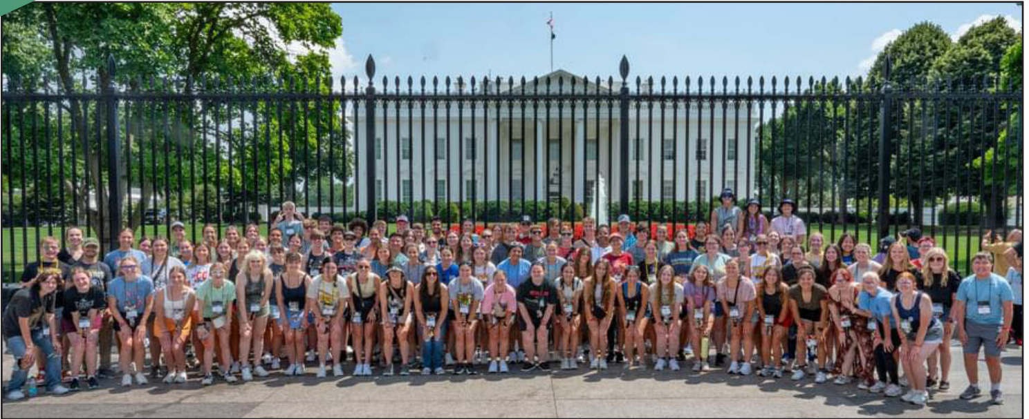
Every year electric cooperatives in Missouri sponsor contests to select delegates for the annual Youth Tour in Washington, D.C. Missouri's 100 electric cooperative delegates for 2024 pose for a picture outside the White House.

Co-op will send 2 juniors to Washington D.C. and 2 to Jeff City