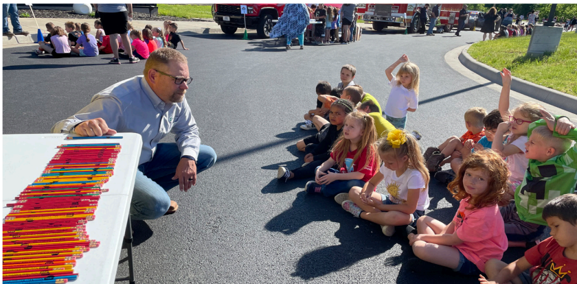
May is electrical safety month. New-Mac gives safety education presentations to kids of all ages.

While the New-Mac motto, "safety first", definitely applies to all of New-Mac's employees as they go about their daily jobs, it's also a message the co-op works hard to impress upon its members and the communities it serves.