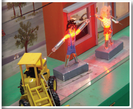
New-Mac uses power town to demonstrate the dangers of electricity (above). Top left, New-Mac lineman shows high school kids the safety equipment they use while restoring power (At left) Your co-op attends many school functions to teach safety.