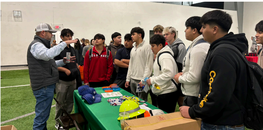
May is electrical safety month. New-Mac gives safety education presentations to kids of all ages.