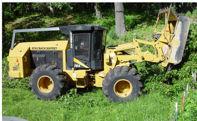
New-Mac Electric's right-of-way crew sport the Jarraff (above), the Hydro Ax (left), a Bobcat (above left). All of these machines are used to safely clear brush and trees from lines. An example of the clearing performed is pictured at the top.