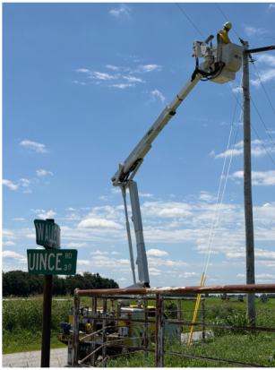
Crews worked around the clock to replace damaged infrastructure and restore power safely.

Storms remind us that when communities work together, we are stronger.